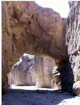
Natural Bridge.

Description: Level walk across lowest place in the western hemisphere. Crust of salt crystals may be covered with temporary lake after rain storms. Watch out for muddy areas. No trail. Do not hike this area during hot months.