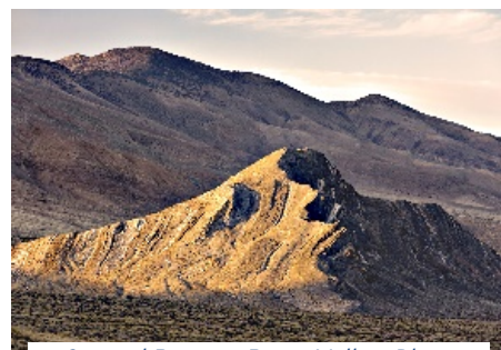
Striped Butte in Butte Valley.

Description: Climb prominent buttes at foot of the Grapevine Mountains. From Hell's Gate, walk SW 1/2 mile to buttes. Scramble up ridge to summit of first butte. Second butte is more difficult and 0.7 mile further. Descend 300' to saddle, then climb 500' to next summit. The ridges are narrow and exposed with steep drop-offs. No trail.