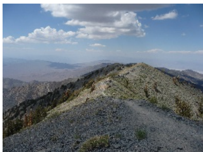
Telescope Peak Trail.

Cool places to hike when the valley is too hot, but may be snow covered in winter.