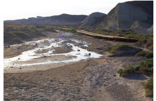
Salt Creek.

Back on the main road, you will skirt around the flat expanse of Cottonball Basin, pass the junction with the Beatty cut- off road, then arrive at the short dirt road leading to Salt Creek . An easy, half-mile boardwalk trail loops around the home of the rare Salt Creek Pupfish. The tiny fish are usually best seen in the springtime when it is their mating season. Watch for the blue-colored male pupfish actively defending their territories. Interpretive signs along the trail allow a self-guided tour of this unique environment.