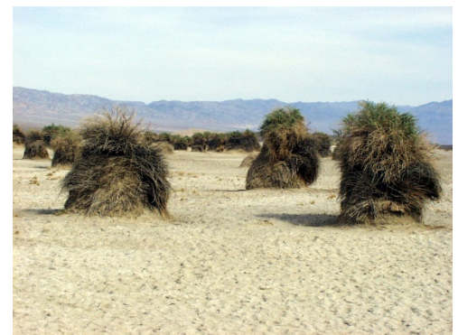
Devil’s Cornfield.

Highway 190 continues north, passes the road junction to Scotty’s Castle, then swings west across the valley. The highway passes through the Devil’s Cornfield where clumps of arrowweed plants growing on mounds of soil somewhat resemble corn shocks. Wind has swept soil from around the plants, while at the same time depositing sand in the branches, forcing them to grow higher.