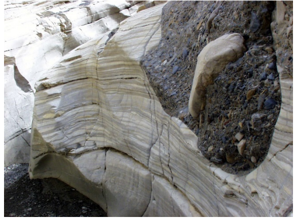
Mosaic Canyon Narrows Rock Formation.

Erosion and Deposition Concurrent with the subsidence has been slow but continuous erosion. Water carries rocks, gravel, sand and silt down from surrounding hills and deposits them on the valley floor. Beneath Badwater lies more than 11,000 feet of accumulated sediment and salts.