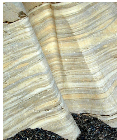
Mosaic Canyon Marble Falls.

Death Valley's rocks, structure and landforms offer a wealth of information about what the area may have looked like in the past. It is apparent that there has not always been a valley here. Death Valley's oldest rocks, formed at least 1.7 billion years ago, are so severely altered that their history is almost undecipherable. Rocks dating from 500 million years ago, however, paint a clearer picture. The limestones and sandstones found in the Funeral and Panamint Mountains indicate that this area was the site of a warm, shallow sea throughout most of the Paleozoic Era (542 - 251 million years ago.)