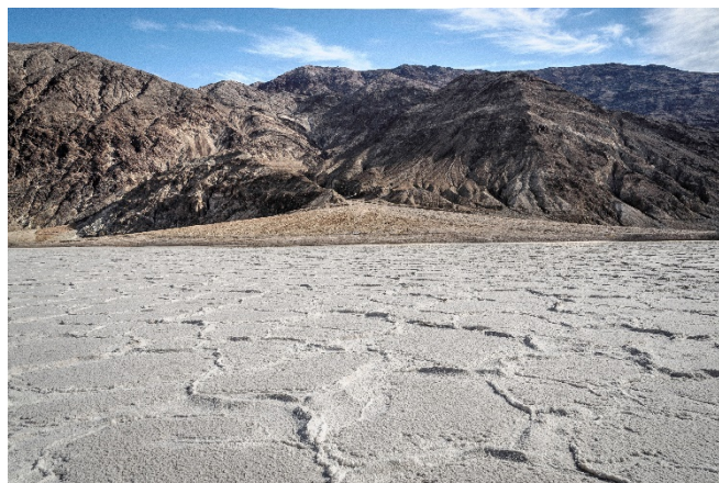
Badwater Salt Flats.

Approximately three million years ago, the dynamics of crustal movement changed, and Death Valley proper began to form. At that time, compression was replaced by extensional forces. This "pulling apart" of Earth's crust allowed large blocks of land to slowly slide past one another along faults, forming alternating valleys and mountain ranges. Badwater Basin, the Death Valley salt pan and the Panamint mountain range comprise one block that is rotating eastward as a structural unit. The valley floor has been steadily slipping downward, subsiding along the fault that lies at the base of the Black Mountains. Subsidence continues today. Evidence of this can be seen in the fresh fault scarps exposed near Badwater.